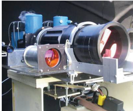
Two Santa Barbara Focalplane infrared cameras were used to collect high-speed imagery (>2,000 fps) of a rocket launch at Kennedy Space Center.